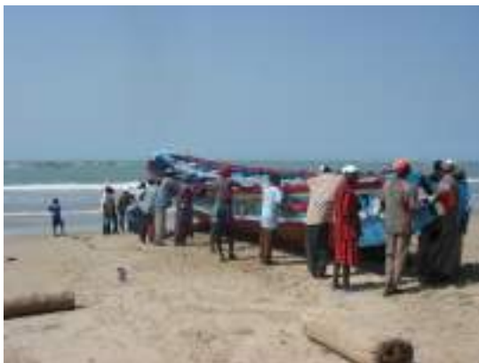
Figure 7: Launch of a new pirogue in the Gambia

Conflicts between the artisanal and industrial sectors have generally decreased in the region, but there is a trend whereby pirogues enter the Exclusive Economic Zones (EEZ) of neighboring countries and then land in their country of origin, demonstrating a transnational aspect of illegality, even within the artisanal sector. There are also accusations that the artisanal sector encroaches into the waters of neighboring countries because it is being pushed out of its own national waters by industrial vessels that infringe and overfish in its IEZ.