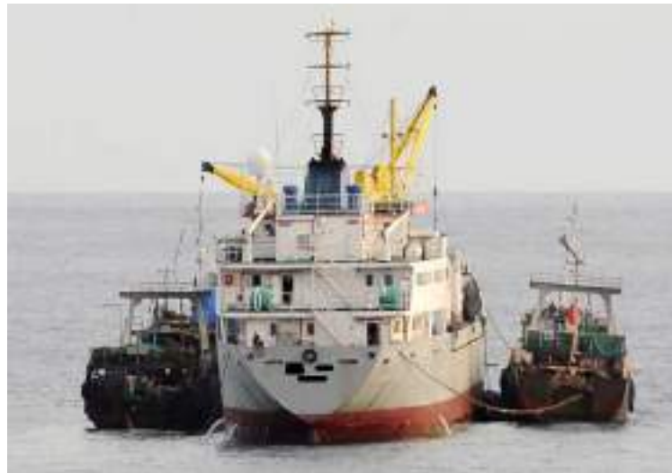
Figure 3: A transshipping operation underway in West African waters between two stern trawlers and a refrigerated fish carrier (reefer). Note the large black fenders (Yokohamas) necessary to prevent the ships from coming into contact with each other. These are carried by the reefer, and their presence on the deck of a reefer indicates that the vessel is likely to engage in transshipping. Black marks on the sides of fishing vessels and reefers are also an indication that fenders have been used and that transshipping may have taken place.

not only represent a fisheries regulatory risk. Out of sight of the authorities, any cargo can be exchanged. Crew members can also easily be moved across vessels, facilitating the occurrence of forced labor at sea. Even when reefer vessels do broadcast vessel tracking information, vessels that come alongside reefers are often not visible to any tracking tools, unlike the reefer whose pattern of behavior in drifting for a few days indicates a risk that undetected and unmonitored vessels have come alongside it. That reefer then has access to secure port facilities and all the logistics of onward supply chains.