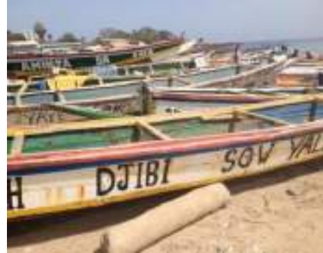
Figure 6: Senegalese pirogues

Conflicts between the artisanal and industrial sectors have generally decreased in the region, but there is a trend whereby pirogues enter the Exclusive Economic Zones (EEZ) of neighboring countries and then land in their country of origin, demonstrating a transnational aspect of illegality, even within the artisanal sector. There are also accusations that the artisanal sector encroaches into the waters of neighboring countries because it is being pushed out of its own national waters by industrial vessels that infringe and overfish in its IEZ.