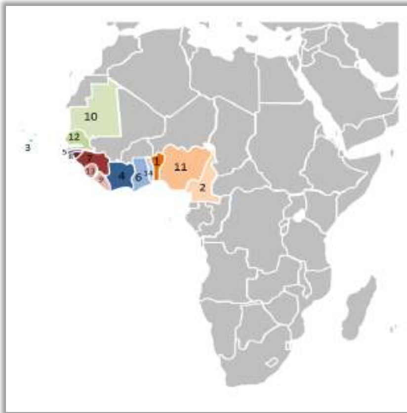
Figure 1: Countries included in the study