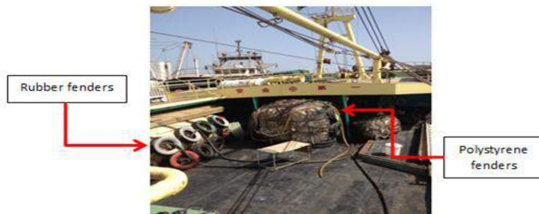
Figure 8: Fenders on board FV Tai Yuan 227, indicative of transhipment activity

The primary evidence for this is the presence of fenders (defence) on the foredeck (see Figure 10 below) which would not normally be on the fishing deck of a longliner. These fenders are to protect vessels from banging against each other whilst transhipping. They also make it easy to transfer crew between vessels.